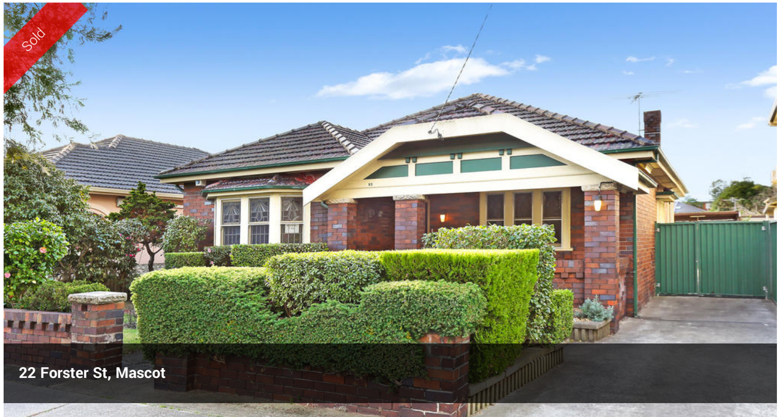
22 Forster St, Mascot